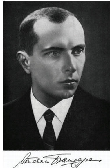
The fascist Stepan Bandera, who fought with the Nazis against the Soviets. He was heroized by Euromaidan coup leaders.

In 1943, the military unit set up by Bandera's OUN(b) carried out a mass extermination campaign against Poles and Jews in Ukraine, killing an estimated 70,000 civilians during the Summer of that year alone. Nevertheless, by April 1948 Stepan Bandera was re-