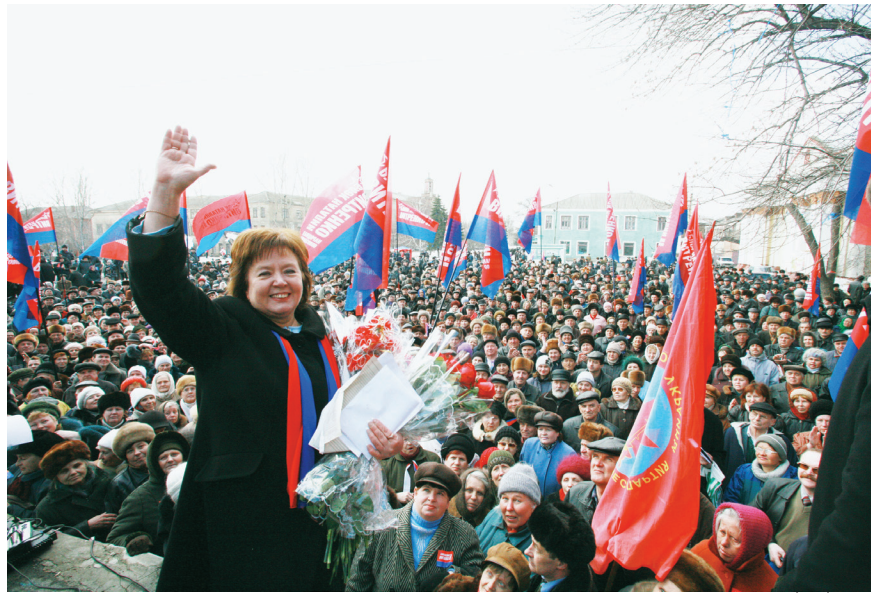
Natalia Vitrenko at a rally of her party, the Progressive Socialist Party of Ukraine.

citing SBU “suspicions” about Vitrenko’s receiving money from the Russian Foreign Ministry-run Fund for the Support and Defense of the Rights of Compatriots Residing Abroad. The allegations date to May 2014, when the bank accounts of Gift of Life were frozen. According to Ukrainian media, this was done “in the framework of an SBU investigation of funds transfers through Ukrinbank, intended for persons suspected of infringement of the territorial integrity and inviolability of Ukraine.” A flood of media reports named Vitrenko as a major sponsor of separatists and terrorists, which are broad categories used by the current Ukrainian authorities against their political opponents.