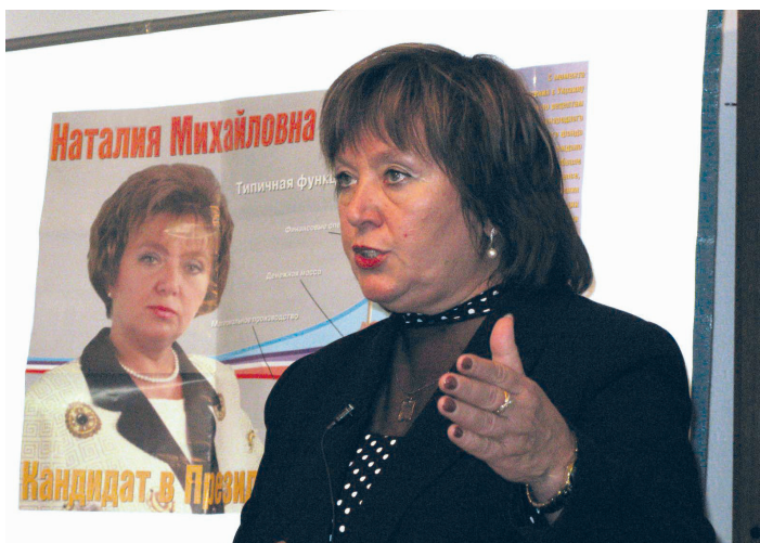
Natalia Vitrenko, doctor of economics, is chairman of the Progressive Socialist Party of Ukraine, has served in Parliament, and run for President.

In my opinion, there are several goals; some are obvious. The first is to undermine the legitimacy of the elected president of the United States. Incidentally, in this connection I would like to note that whether people who do it want it or not, they greatly damage U.S. interests. It seems that they trained for this in Kiev, and now are ready to organize a Maidan in Washington not to let Trump assume office. The second goal is to tie the hands and legs of the newly-elected president related to the implementation of his pre-election cam-