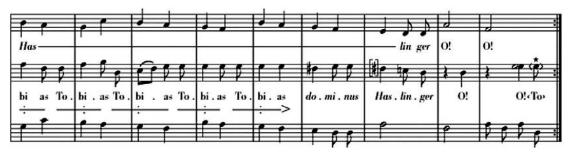
[* Mehrere Durchstreichungen: ursprünglicher Text nur teilweise erkennbar.]