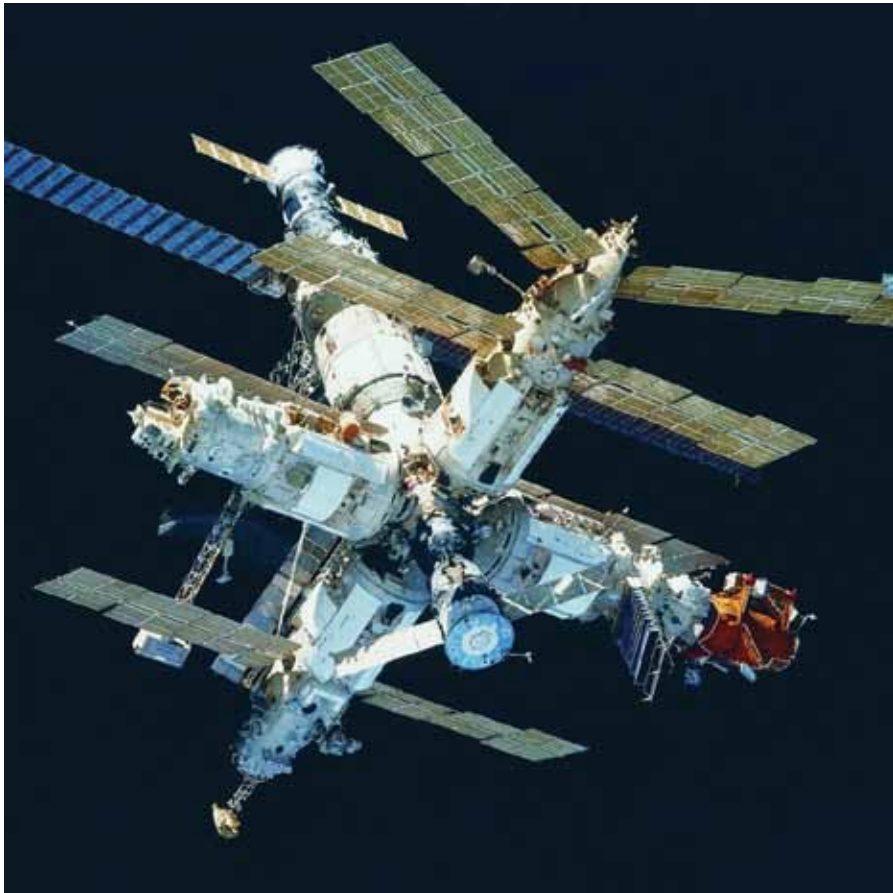
All China Women's Federation

China expects to complete the construction of its space station, depicted here, by 2023.