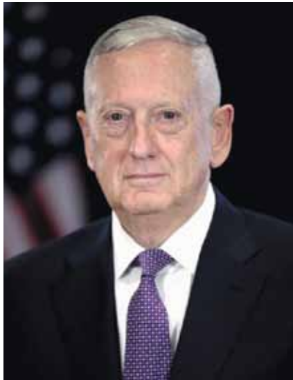
Office of the President-elect James Mattis