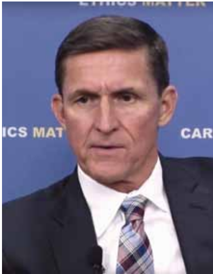
Lt. Gen. Michael T. Flynn