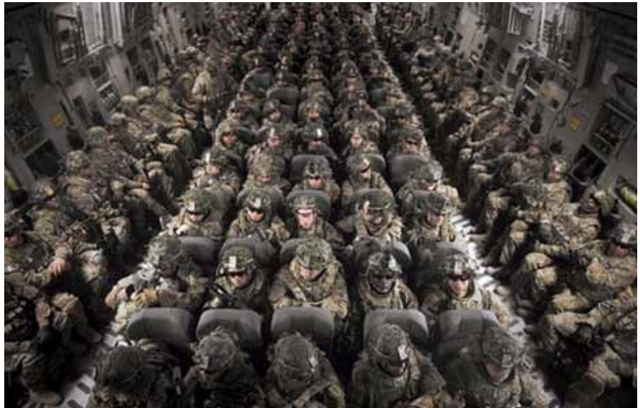
Paratroopers on NATO maneuvers in Estonia are part of the largest military mobilization on Russia's western border since World War II.

That cannot go on. But this is the reason that I'm saying that this revolt will go on until the causes of the injustice are remedied, and we will again have governments which take care of the common good of the people. Now, it is almost the case, that people in Europe, when you say the purpose of government is to be for the common good of the people, they look at you and say, "What?! I never heard such a thing." Because politi-