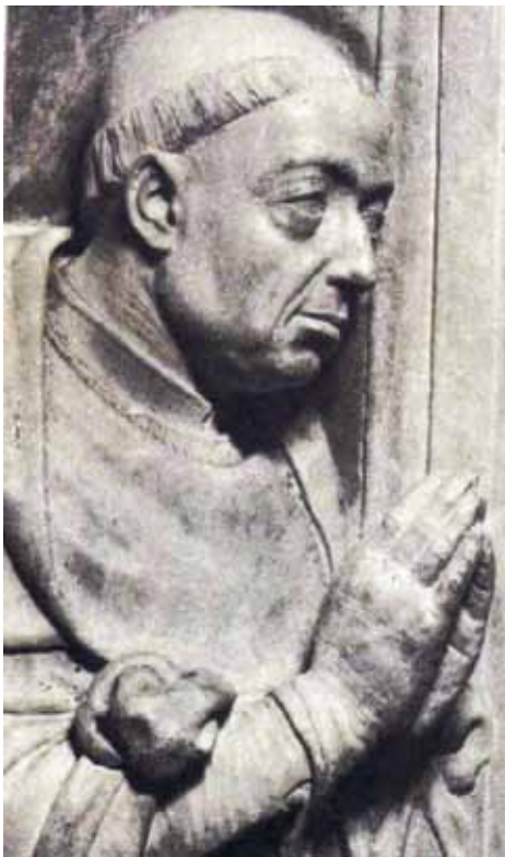
Nicholas of Cusa, 1401-1461

I mean, there will be still legitimate room for nations, for languages, for culture, but you have to start in your mind with the one humanity, and there must never again be an interest of one nation or a group of nations, which is in violation of the interests of mankind as a whole. And either we make that jump or we will not