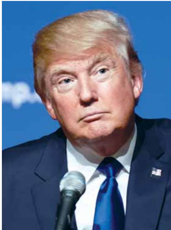
U.S. President-elect Donald Trump

There is also the effort by the neocons to ruin the