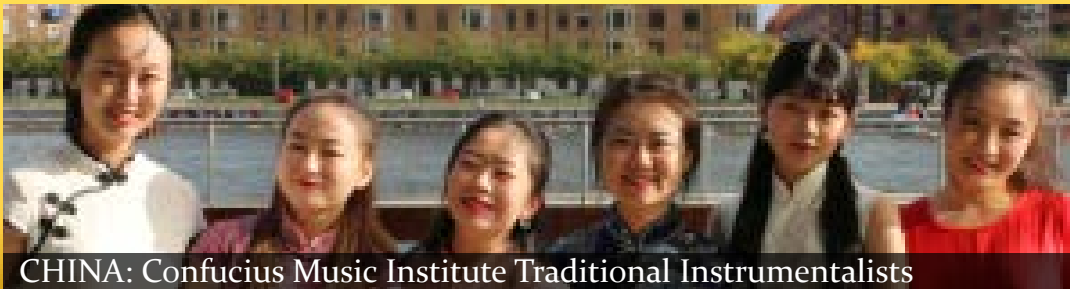
CHINA: Confucius Music Institute Traditional Instrumentalists