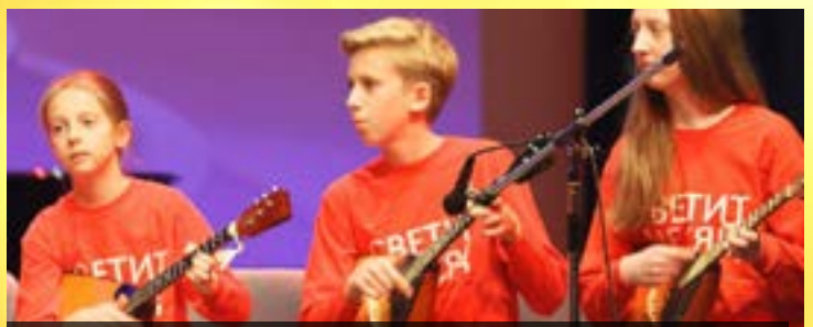
RUSSIA: CHILDREN'S ORCHESTRA »Svetit mesjac«